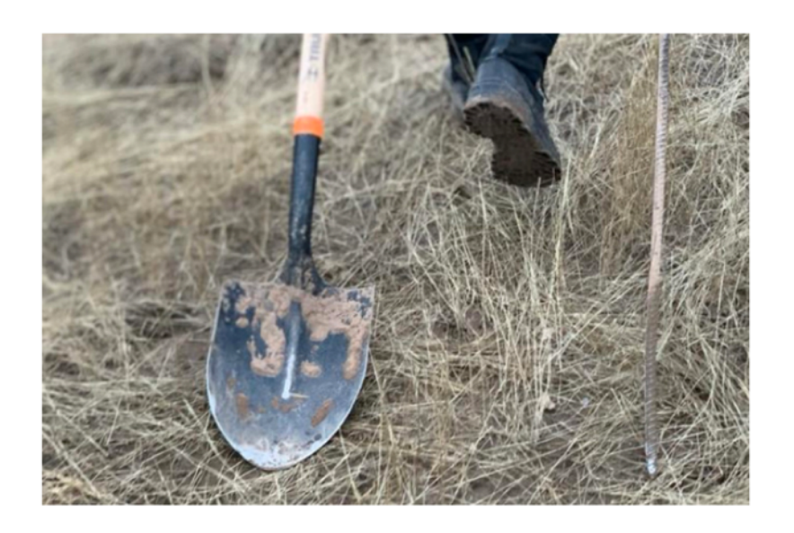
Finding Mexico's hidden graves

For more than ten years, Mexican authorities