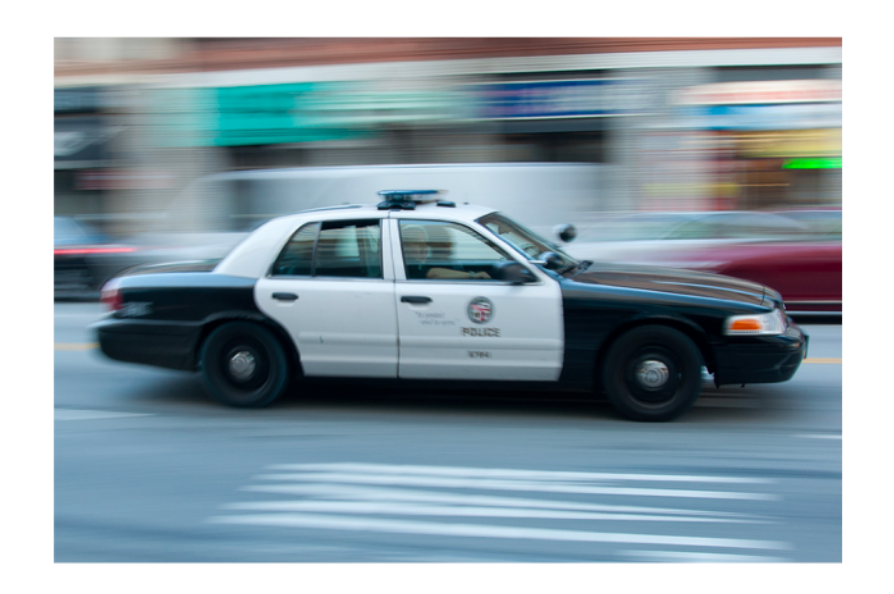
Data science and police accountability